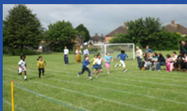
Super fun sports days