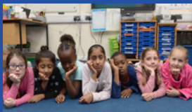
Pyjama Day charity